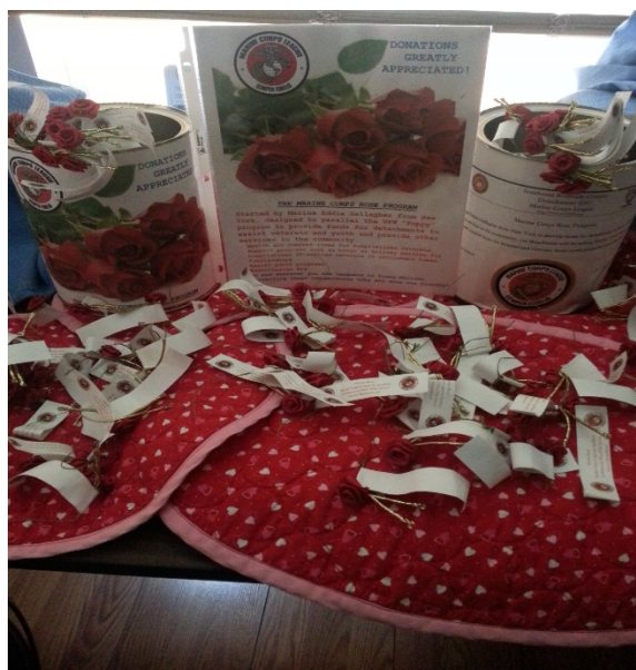
MARINE CORPS ROSE