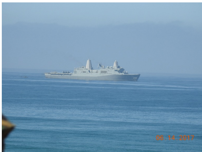
Marine Air- Ground Task Force Demonstration. This is the Naval Ship where all the amphibious vehicles disembarked from.