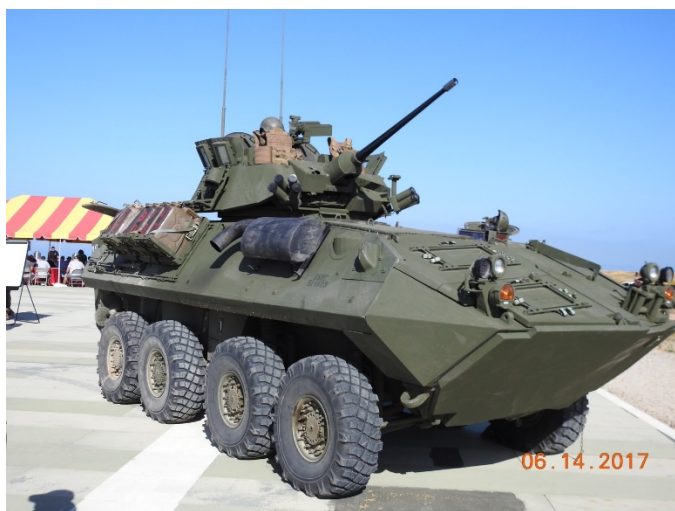
Marine Air- Ground Task Force Demonstration. Static Display of Light Armored Vehicle (LAV).