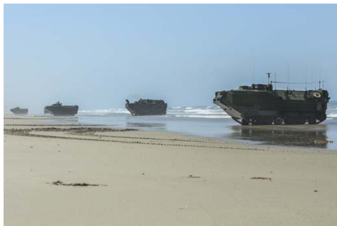
Assault Amphibious Vehicles (AAV), with 15th Marine Expeditionary Unit, lined up in formation on Red Beach during the Marine Air- Ground Task Force demonstration for the 75th Anniversary on Camp Pendleton, Calif., June 14, 2017. The demonstration allowed all in attendance to observe Marines as they recertified their qualifications before deployment.