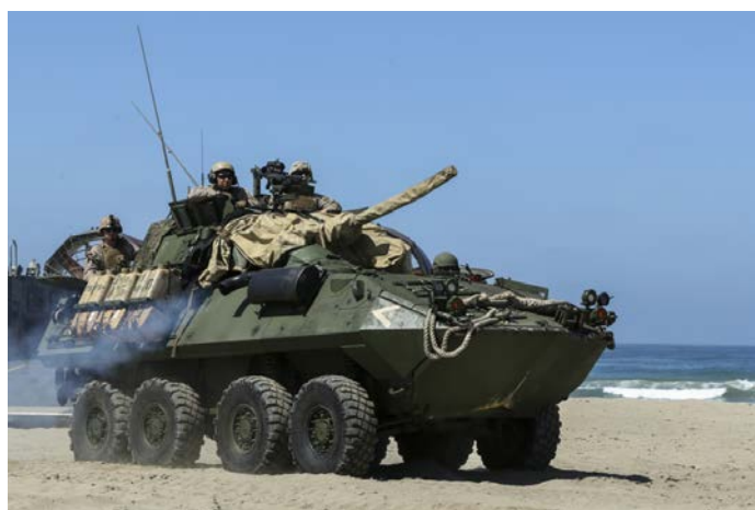
A Light Armored Vehicle (LAV), with 15th Marine Expeditionary Unit, moves to the static display area for the guests to view at Red Beach during the Marine Air- Ground Task Force demonstration for the 75th Anniversary on Camp Pendleton, Calif., June 14, 2017. The demonstration allowed all in attendance to observe Marines as they recertified their qualifications before deployment.