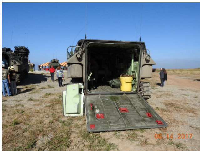
Marine Air- Ground Task Force Demonstration. Static Display of back end of an Assault Amphibious Vehicle (AAV).

Facebook Administrator: Larock Benford www.facebook.com/SouthwestRiversideCountyMCL1057