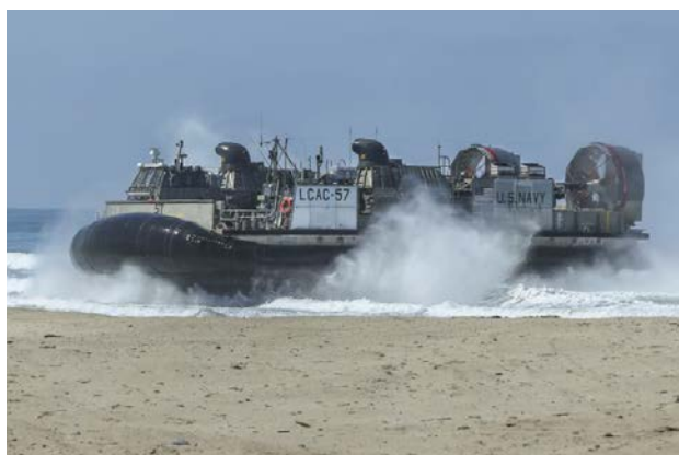
A Landing Craft Air Cushion (LCAC), with 15th Marine Expeditionary Unit, lands at Red Beach during the Marine Air- Ground Task Force demonstration for the 75th Anniversary on Camp Pendleton, Calif., June 14, 2017. The demonstration allowed all in attendance to observe Marines as they recertified their qualifications before deployment.