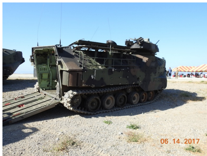
Marine Air- Ground Task Force Demonstration. Static Display of an Assault Amphibious Vehicle (AAV).