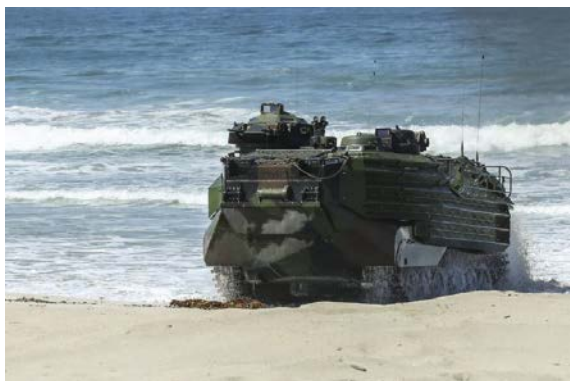
An Assault Amphibious Vehicle (AAV), with 15th Marine Expeditionary Unit, lands on Red Beach during the Marine Air- Ground Task Force demonstration for the 75th Anniversary on Camp Pendleton, Calif., June 14, 2017. The demonstration allowed all in attendance to observe Marines as they recertified their qualifications before deployment.