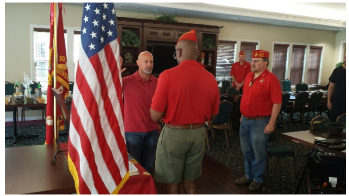
Waco Merchant Swearing-in_27 May 2017