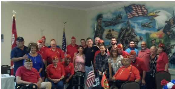
24 June 2017, Appreciation Breakfast conducted at the Wildomar VFW Post 1508. MCL Det 1057 members pictured here savoring the occasion.