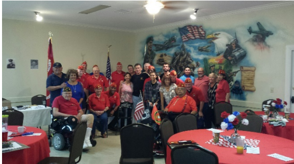
24 June 2017, Appreciation Breakfast conducted at the Wildomar VFW Post 1508. MCL Det 1057 members pictured here savoring the occasion. Notice the décor/table settings.