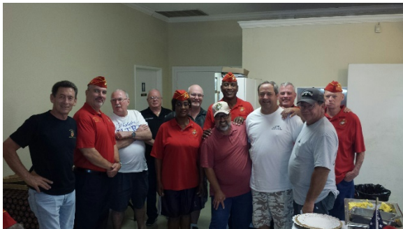
24 June 2017, Appreciation Breakfast conducted at the Wildomar VFW Post 1508. MCL Det 1057 members pictured here with VFW Post 1508 members who helped make it a success.